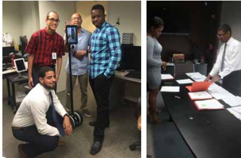
Participants of the Dan Marino Foundation Career Launch Program are learning valuable employment skills that will give them the competitive advantage in the job market.

In June of 2016, the Able Trust awarded a three-year, $250,000 grant to the Dan Marino Foundation (DMF), with the goal of helping the Foundation design and develop its Career Launch Program, which now plays an integral role in preparing its students for employment.