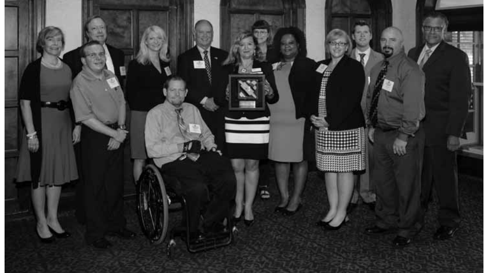
Fourteen awardees were recognized at the 2014 Ability Awards. Read about them in this edition of The Florida Grantor.