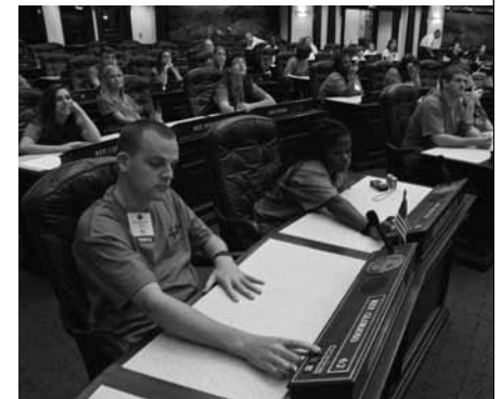
Youth Leadership Forum delegates vote on a bill in the Florida House Chambers.

This past July, the 2010 Florida Youth Leadership Forum (YLF) sought out to do just that. Nearly 70 students (including more than 20 second-year participants) with disabilities ventured to Tallahassee for four days of leadership and social training. This unique event was sponsored by The Able Trust with funding assistance from the Florida Developmental Disabilities Council. Florida's future leaders participated in events such as Capitol Day -- where students participated in a mock legislative session -- and a career fair which featured 20 local career mentors representing 12 vocations ranging from Agriculture and Environment to Science and Technology.